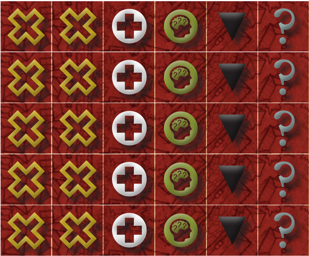
dice faces, sized for 1" dice